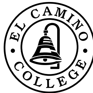
ECC Logo in Black