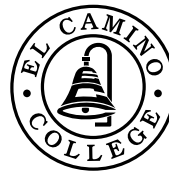
ECC Compton Center Black and White Logo