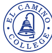
ECC Compton Center Two-Color Logo