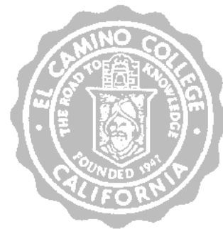
ECC seal in Pantone 421