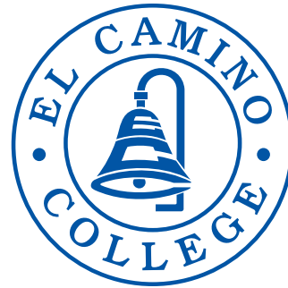
ECC Logo in Reflex Blue

Please refer to the Communications Guide & Graphics Standards manual for more information.