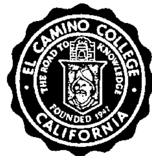
ECC seal in Black